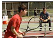
'Awake' has engaging premise