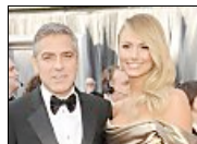
Photos: Oscars' fashion victories