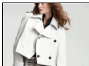
Top Oscar trend: glamorous white