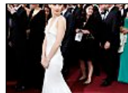
Photos: Oscars' worst dressed